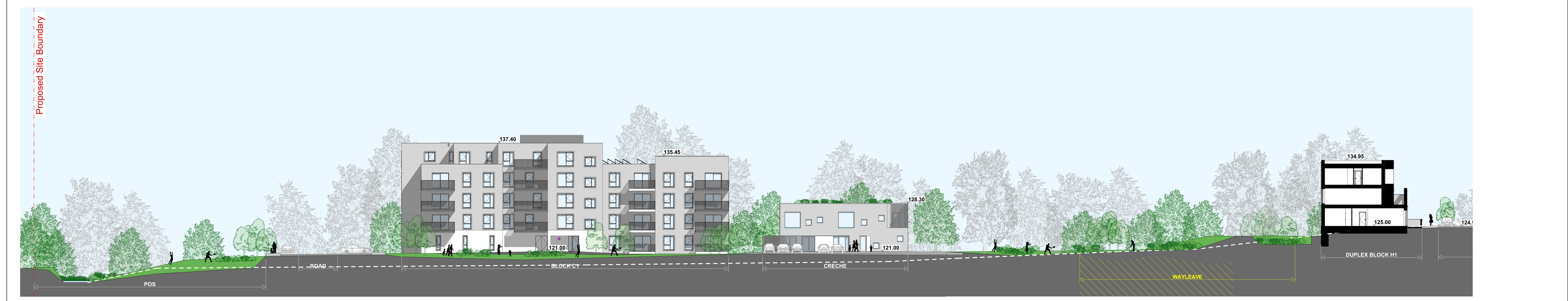
Site Elevation 01