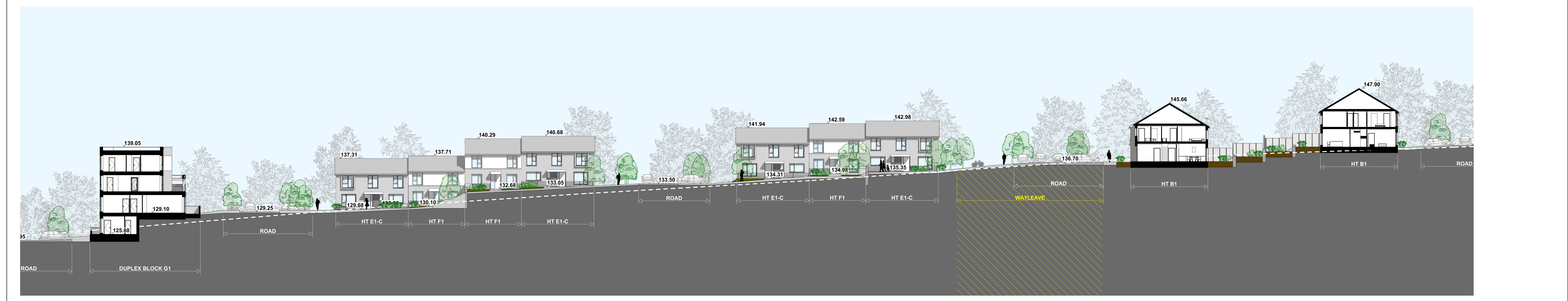
Site Elevation 01