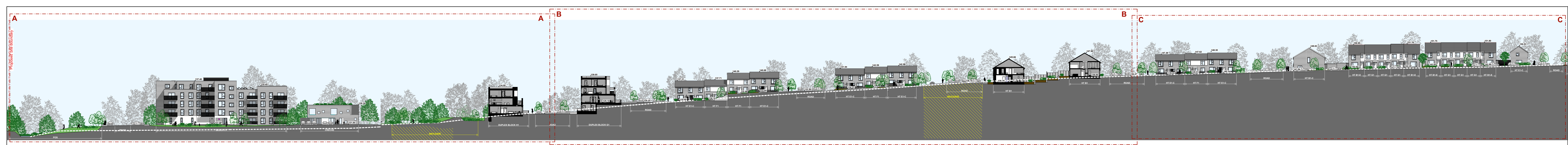
Site Elevation 01