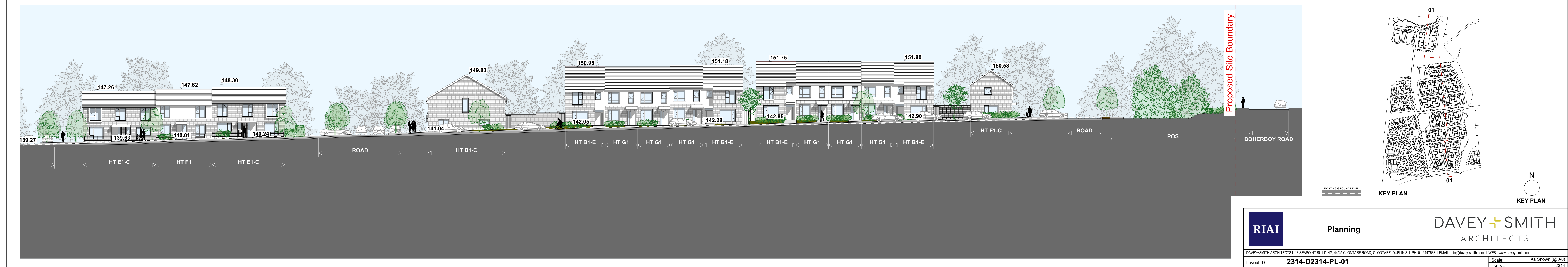
Site Elevation 01